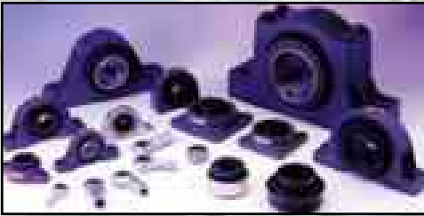
Power Transmission Products