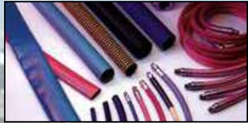
Hydraulic & Industrial Hose